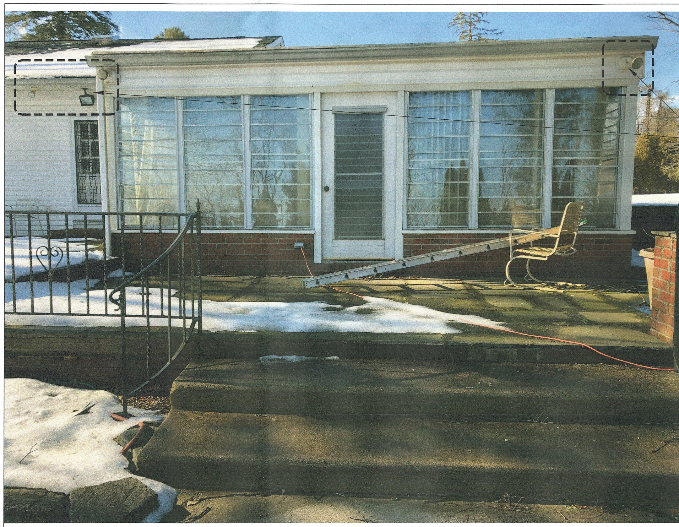
3 EXISTING REAR SUNROOM N.T.S.