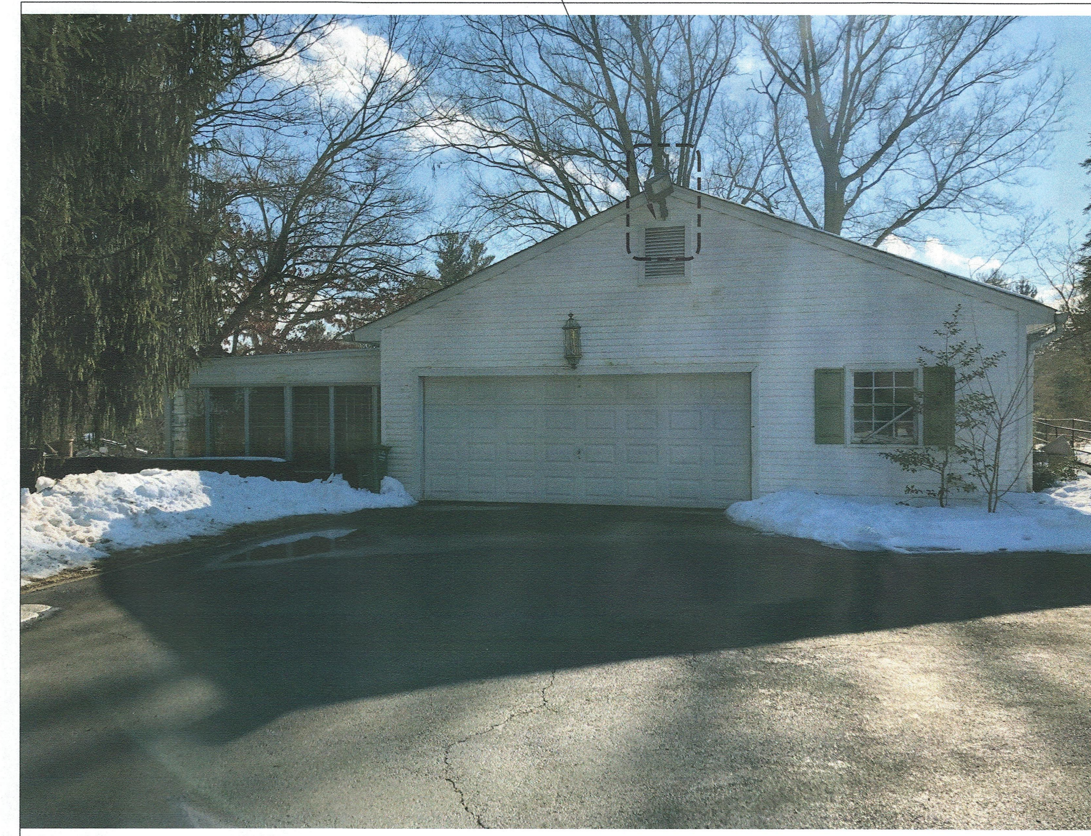
4 EXISTING SIDE OF BUILDING N.T.S.