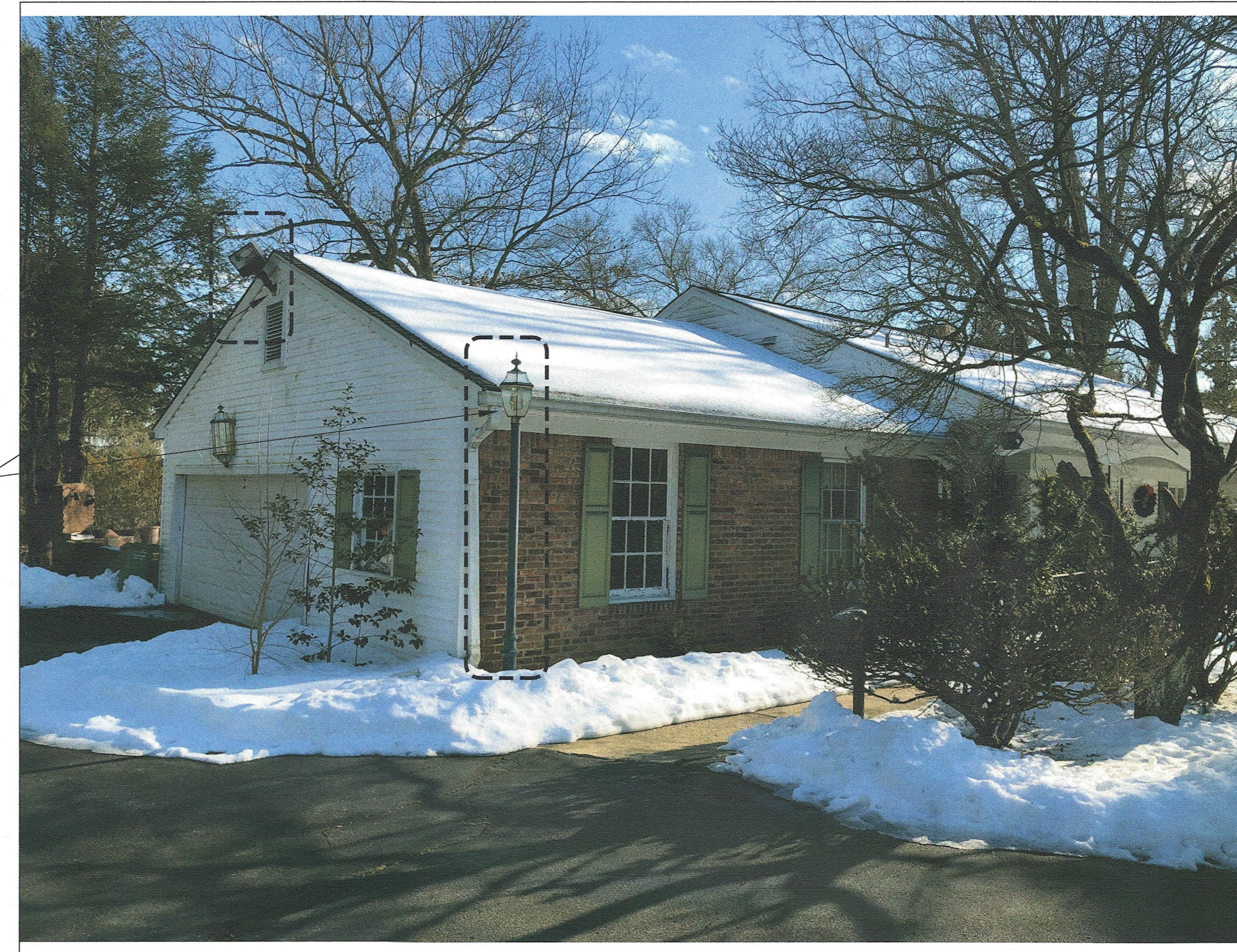
2 EXISTING BUILDING N.T.S.