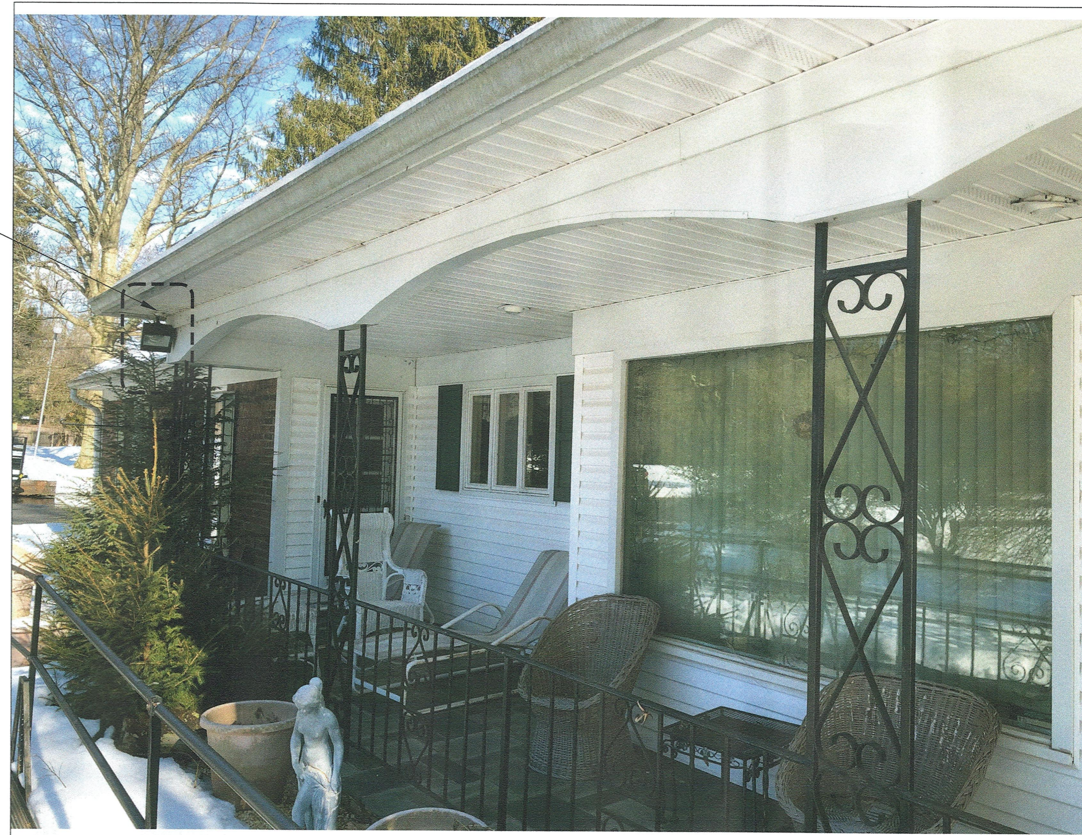
4 EXISTING FRONT PORCH N.T.S.