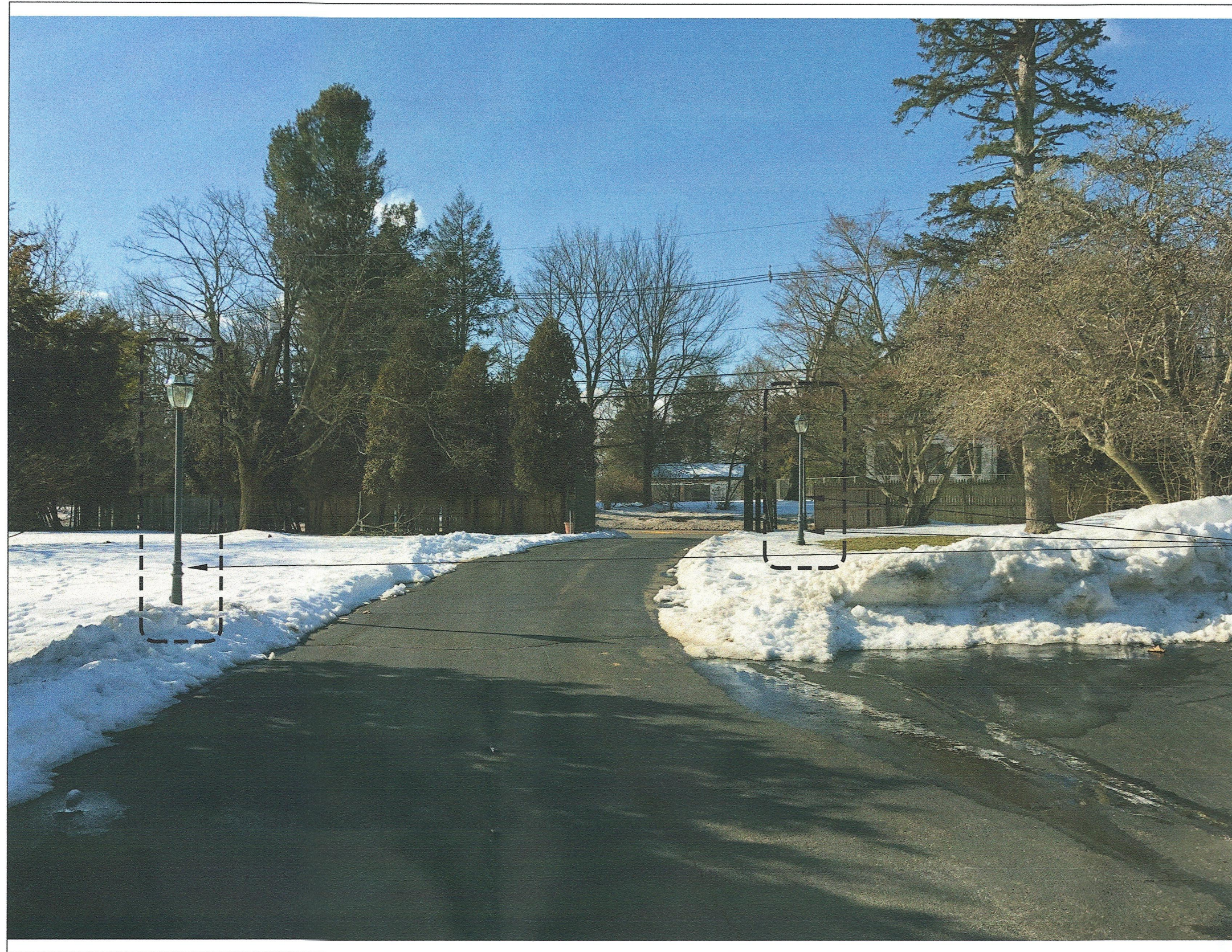
1 EXISTING MAIN ENTRANCE N.T.S.