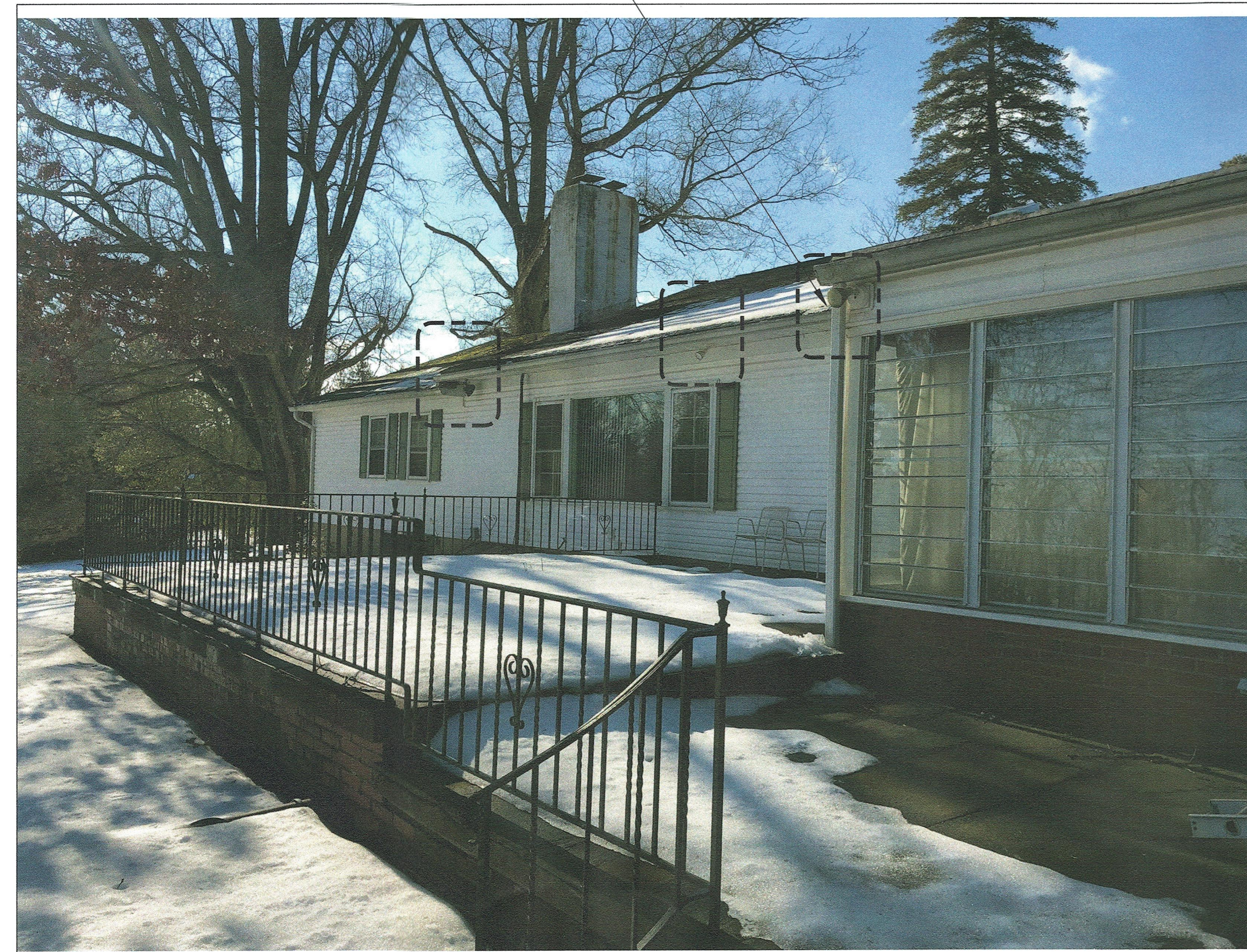
3 EXISTING REAR OF BUILDING N.T.S.