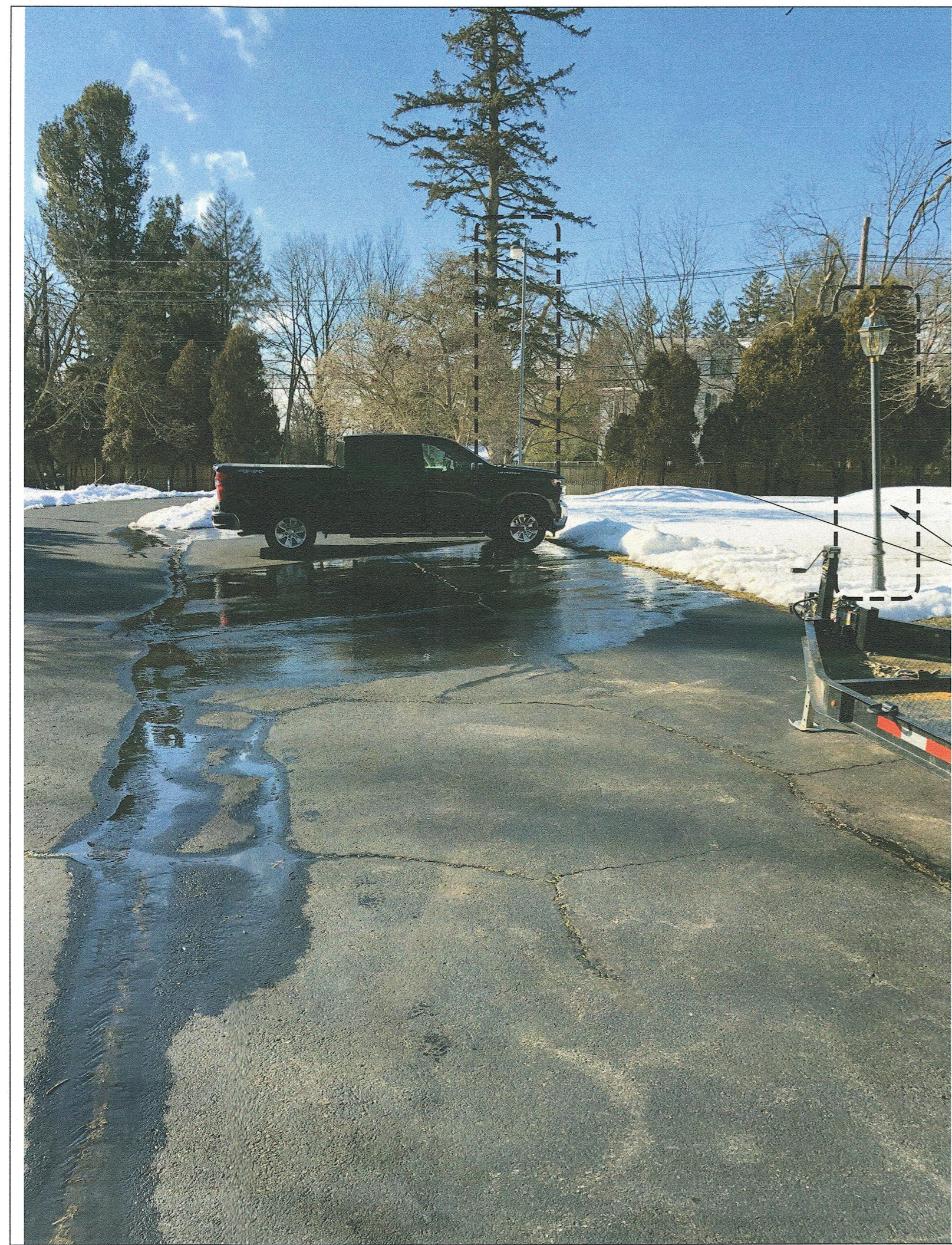
1 EXISTING PARKING N.T.S.